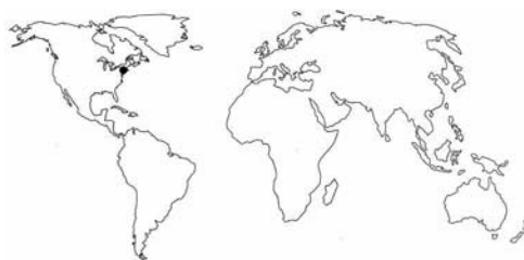
1950: • Cities of 10-million or More. (New York)