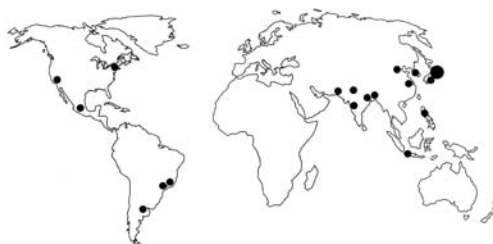
2000: • Cities of 10-million or more; ● Cities of 20-million or more.